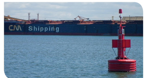
TRIDENT-3000 installation, Port of Newcastle, Australia