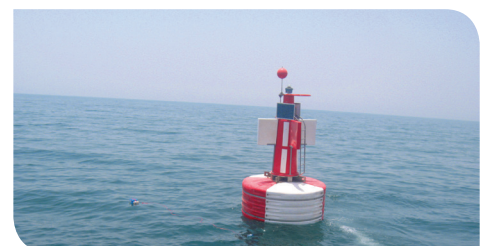
TRIDENT-3000 installation, Middle East