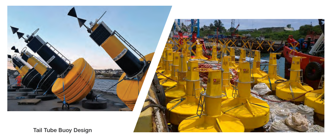
Twin Keel Buoy Design

The twin keel buoy design is a safer alternative over the traditional tall tube buoy as it is designed to stand on a flat surface. The equipment can be kept upright during assembly, transport and during deployment offering a safer alternative for mariners.