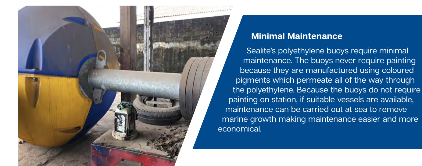
Tail tube design requiring maintenance

Rotational moulding of polyethylene allows Sealite to manufacture complex shapes which are moulded in one piece making a robust product with excellent impact strength. In the unlikely event of damage, the buoys can be easily repaired.